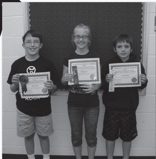
(2010 Winners photo)