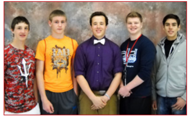
April Red Devil Spirit Award Winners

Wednesdays in July 7/2, 16, 23 & 30 | 8 a.m. - 12 p.m.