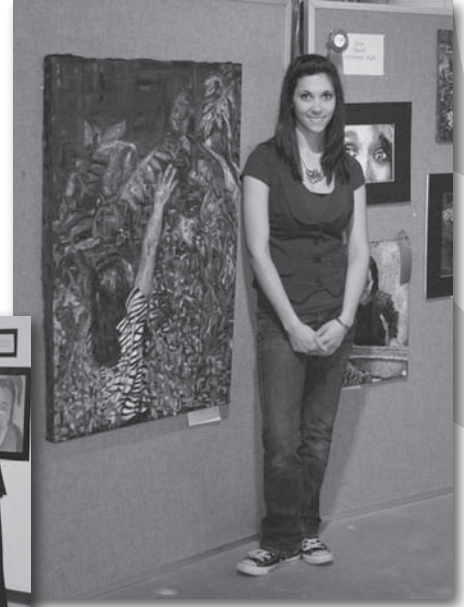
MIDDLE SCHOOL STUDENTS